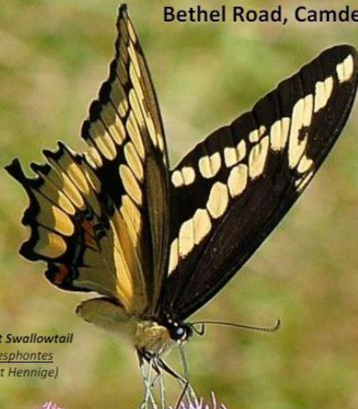
Eastern Giant Swallowtail Heraclides cresphontes

Learn to find and identify flora, fauna and fungi