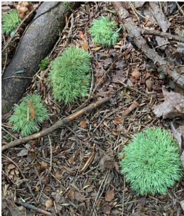
Pincushion Moss ( Leucobryum glaucum)

GOOD NEWS! We have the large meeting room at Ongwanada (on Portsmouth Ave) booked for 16 February, 16 March and 20 April. These will be hybrid meetings. You will be able to come in person, connect via Zoom, or listen by telephone.