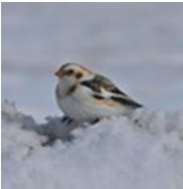
Motus is being used to track Snow Buntings in eastern North America.

Thursday 16 December is member's night. Do you have some pictures or a short video to share?