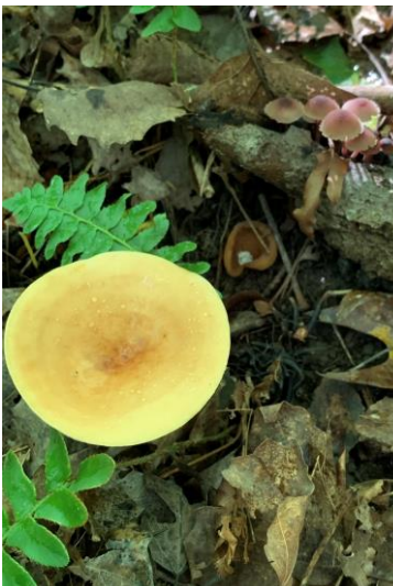
A whole community invites you to get up-close-and-personal at Helen Quilliam Sanctuary

The KFN executive will meet on Wednesday 2 September. We will decide at that time if it is possible/wise to proceed with our dinner meeting. Results of that meeting will be posted on the KFN website and sent with the October newsletter. (The newsletter will be sent out by 11 September.)