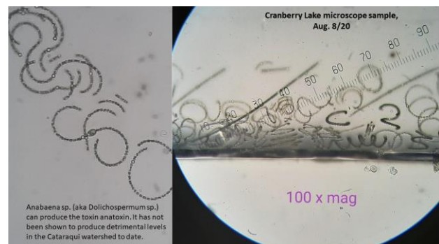
Anabaena August 8, 2020