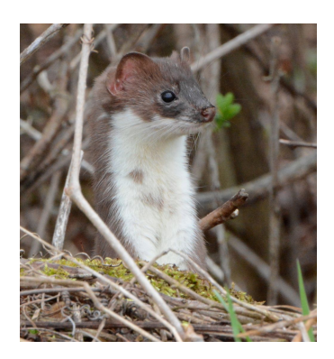
Figure 23: Short-tailed Weasel. (Katherine Webb)