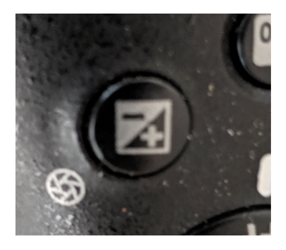
Figure 35: Photo 9. (Anthony Kaduck)

If you want to experiment with exposure compensation, the first step is to find how to adjust exposures on your camera. I recommend reading the