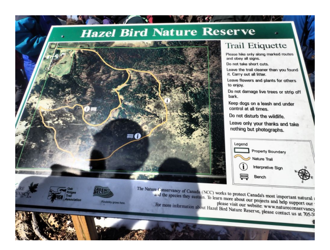
Figure 32: Sign at Hazel Bird Nature Reserve. (Jacqueline Bartnik)

12 years. By the third stage, they start to note the return of native vegetation. All this is done with machines as they are usually doing hundreds of acres.