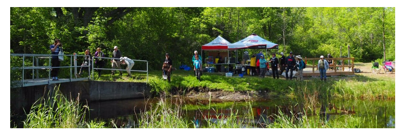
Figure 8: Activity at BioBlitz Base site.

We held our 21st BioBlitz June 14-15th in cooperation with Ontario Power Generation Lennox Generating Station on the OPG property on Bath Road. This property has wetlands, woodlands and old field habitats offering a diversity of plant and animal life. The BioBlitz aims to list as many species of living things as possible in 24 hours. This snapshot of the biodiversity provides a baseline for observing future changes caused by global warming, invasive species and loss of endangered species as well as through natural succession. It rained before the Blitz began and after it was over. We were lucky to have some sunshine and comfortable temperatures but the wind was strong, affecting the moth collection station and the spring had been cool delaying development of some species.