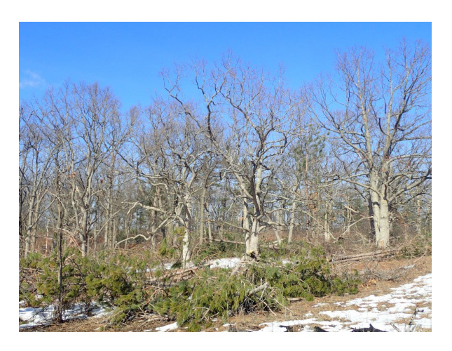
Figure 31: Oak Savannah at Rice Lake. (Jacqueline Bartnik)

pine, larch and white spruce plantations. They are hopeful that with the thinning and burning, the natural mixture of vegetation will return such as Red, Black and White Oak, Sugar and Silver Maple, Largetooth and Trembling Aspen, White Ash, Basswood, American Elm, Eastern Hemlock, White Cedar, White Pine, White and Yellow Birch, Black Cherry, American Beech and other conifers plus other vegetation. Past agricultural practices have destroyed much of the natural occurring wetlands, sand dunes and Black Oak savannah /woodland. Nearly all of Northumberland County is located on the Oak Ridges Moraine regulated provincially by the Oak Ridges Moraine Conservation Plan. We walked to several locations, but due to the weather our trip had to be reorganized. We took a break for treats and drinks and returned to our buses and headed off to Rice Lake a NCC property to witness the restoration in this area. They have started removing Red Pine and other nonnative species and scheduled a prescribed burn this year. You can start to see the return of the Oak Savannah. We returned to our hotel and prepared for the OWA social hour at 6 pm where we had cocktails, treats and supper at the hotel. After the long walk through the woods and the social hour, we all decided to go to bed early since the conference was starting early the next day.