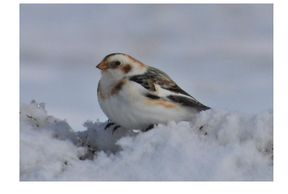
Figure 26: Snow Bunting, March 6, 2019, Howe Island. (Peter Waycik)