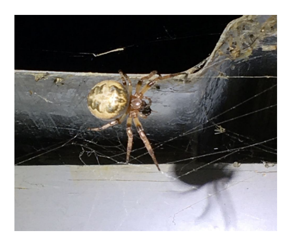
Figure 12: Furrow Orbweaver. (Damon Gee)

In total 160 invertebrates were recorded.