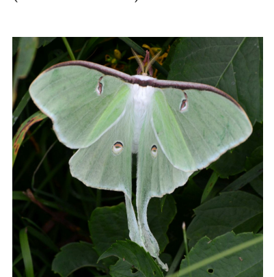
Figure 19: Luna Moth. (Katherine Webb)