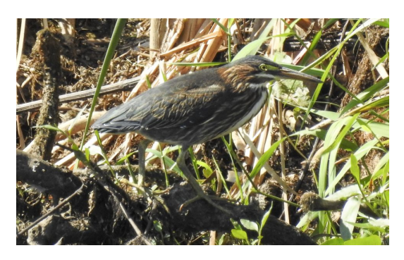
Figure 3: Green Heron, Perch River Wildlife Management Area, 14 August 2019.

I don't have any other issues to discuss, so I will leave you with a puzzler. This Green Frog was spotted last week by the Marsh Boardwalk at Presqu'ile Provincial Park. It has swallowed something leaving a reddish fringe sticking out of its mouth. Any guesses what it might be?