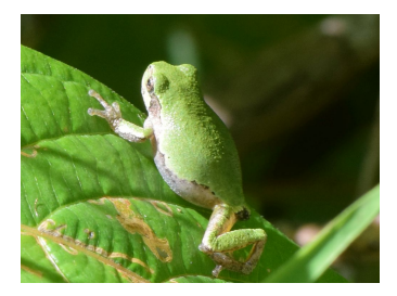
Figure 45: Gray Tree Frog. (William Depew)