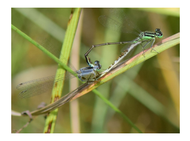
Figure 41: Eastern Forktail. (William Depew)

Grasshopper and Henslow's sparrows were reported in particularly good numbers this summer. Art Bell reported 3 separate places where he heard singing males and there were at least 3 in the vicinity of the Gore Road. This is an appreciable increase over the numbers reported in previous years of Henslow's sparrows.