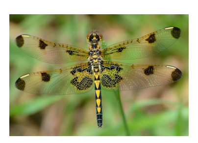
Figure 21: Calico Pennant. (Katherine Webb)