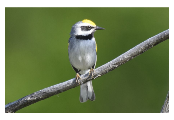
Figure 5: Golden-winged Warbler, Algonquin Provincial Park, 19 June 2019. (Anthony Kaduck)