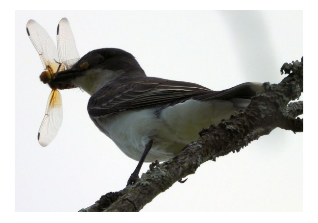
Figure 37: Eastern Kingbird with its lunch.

When we crossed Maple Leaf Road coming back we knew we were not far from the cars all safely parked on Opinicon Road. We were back in Kingston before 14:00 as advertised.