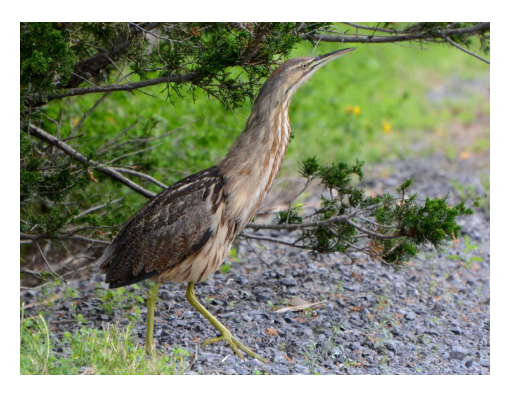
Figure 17: American Bittern. (Kathy Webb)