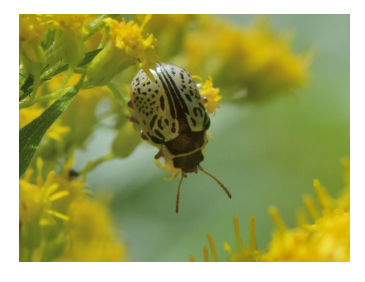
Figure 46: Common Willow Calligrapher Beetle. (William Depew)