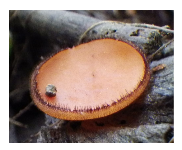
Figure 10: Eyelash Fungus. (Janet Elliott)

In total 322 plants and 33 fungi were listed.