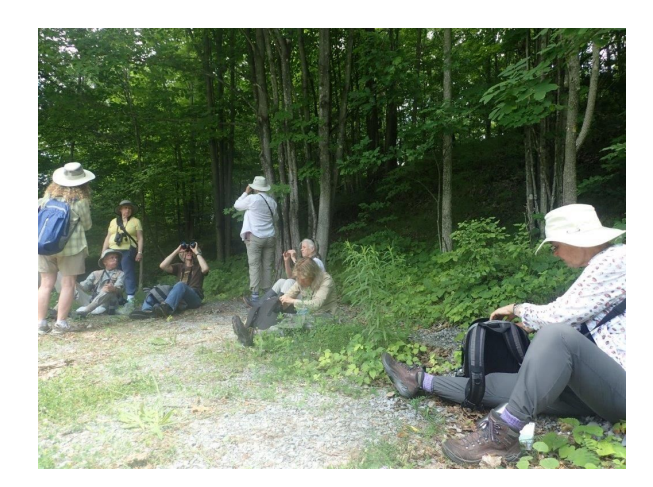
Figure 33: KFN members enjoying lunch during a ramble. (Jackie Bartnik)

In the early days of the club, Roland Beschel willingly shared his botany knowledge and to-day members' interests cover (among other things) birds, butterflies, dragonflies/damselflies, bats, reptiles, amphibians, insects, plants, lichens and fungi.