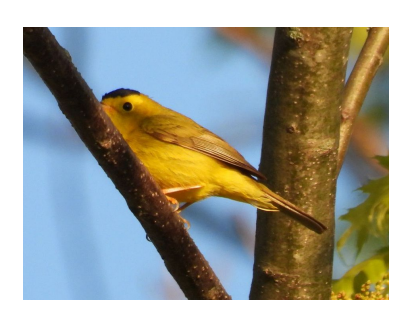
Figure 25: Wilson's Warbler, May 27, 2019, Howe Island. (Peter Waycik)