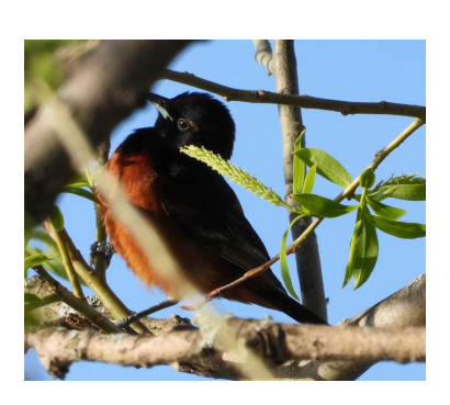
Figure 27: Orchard Oriole, May 18, 2019, Howe Island.