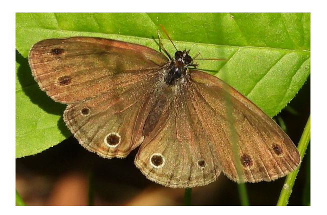
Figure 36: Little Wood Satyr. (Peter Waycik)

Shady spots were found for lunch and chatting.