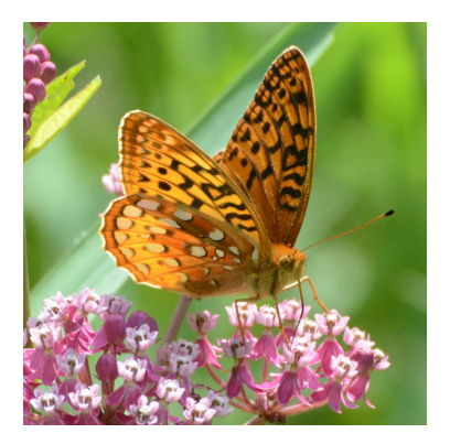
Figure 20: Great Spangled Fritillary seen during the Butterfly and Dragonfly Field Trip to Echo Lake Road. (Katherine Webb)