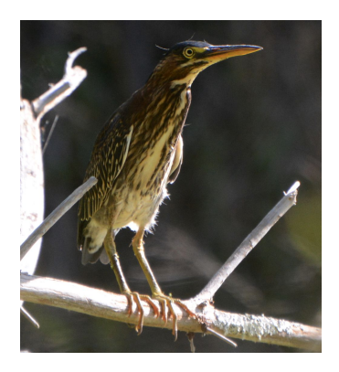
Figure 22: Green Heron at Little Cataraqui Conservation Area. (Katherine Webb)