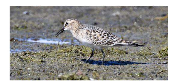
Figure 4: Baird's Sandpiper, Presqu'ile Provincial Park, 24 August 2019. (Anthony Kaduck)