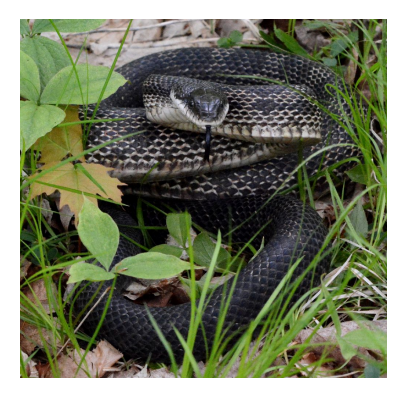
Figure 18: Gray Ratsnake at Marble Rock Conservation Area. (Katherine Webb)