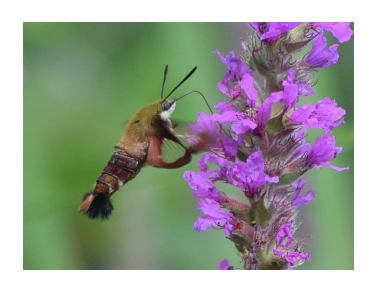
Figure 42: Hummingbird Clearwing. (William Depew)