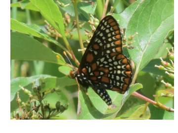
Figure 43: Baltimore Checkerspot. (William Depew)