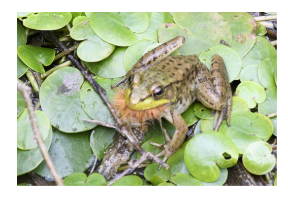
Figure 1: Green Frog with mystery lunch.

I don't have any other issues to discuss, so I will leave you with a puzzler. This Green Frog was spotted last week by the Marsh Boardwalk at Presqu'ile Provincial Park. It has swallowed something leaving a reddish fringe sticking out of its mouth. Any guesses what it might be?