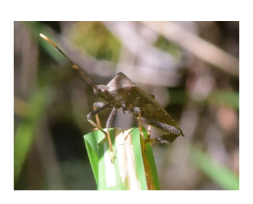
Figure 44: Acanthocephalo terminalis. (William Depew)