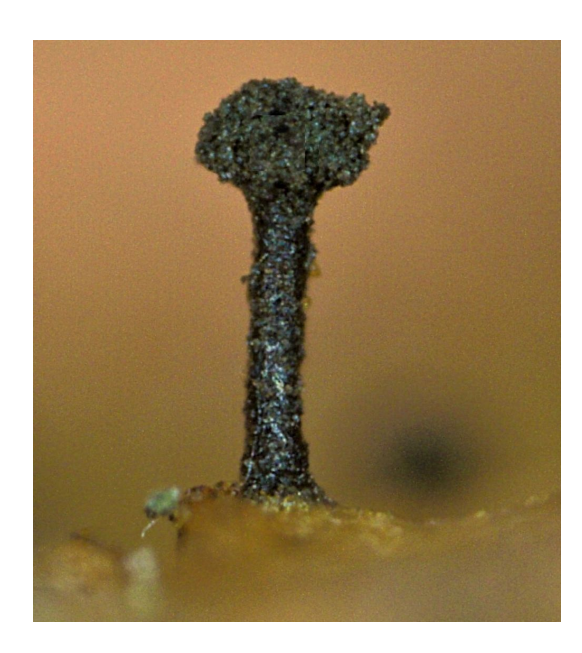
Figure 9: Fruiting Body (apothecia) of new fungus lichen ally Chaenothecopsis perforata. Just 0.5 mm tall. (Troy McMullin)

Visitors could learn about the biodiversity of the site by participating in Guided Walks to learn about a particular group of plants or animals. One could join a walk to learn about Early Morning Birds or Snakes or Lichens and Mosses. Walks also included the popular Geology of the site. Telescopes were set up to view the night sky as well as the Peregrine nest and nestlings on the building, Osprey nest by the road and Great Blue Heron nests in the wetlands.