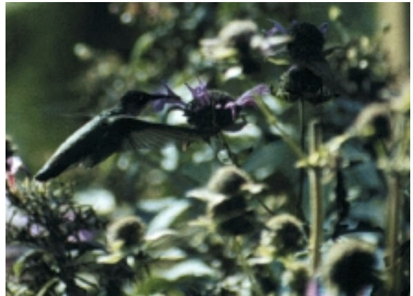
Hummingbirds, shown feeding on a beebalm, not only eat flower nectar but also eat insects like spiders.

Numerous trees, shrubs and vines also attract hummingbirds. Some favourites include butterfly bush (no garden should be without!), hibiscus, flowering crab apple and honeysuckle. Of the vines morning glory and in particular trumpet honeysuckle are a garden must. Table 2 summarizes hummingbird plants that are available at most nurseries, or from mail-order garden catalogues, such as Stokes.