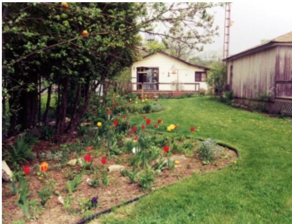
Figure 2: The spring time garden. Narrow beds along buildings and curving beds elsewhere.

Designing a hummingbird garden in connection with an existing garden is much easier than starting from scratch but both require similar designs. Hummingbirds require narrower gardens than butterflies in order to access flowers on either side. Curving flower beds and clusters of trees and shrubs are better suited to the needs of hummingbirds so they can approach the blooms from all sides. The garden should not be crowded with large trees and shrubs. A good balance is \frac{1}{4} shade, \frac{1}{4} partial shade, \frac{1}{2} open area of lawn, ground cover, or flower beds (Figure 2). Create a variety of levels with tall trees, medium-height trees, shrubs, flowers and low grassy areas. These different areas will give your hummingbirds choices of where to feed and perch. 3 Male hummingbirds prefer to have one large tree to use as a strategic lookout post. 3