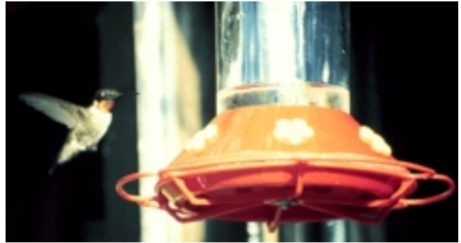
Male Ruby-throated Hummingbird coming to a glass feeder. Note the low level of the feeder solution so it can be changed more often.

One nice thing that a hummingbird feeder does provide is easy viewing of the hummers and also allows you to start feeding them early in the season, like in May, when they just return, but when no flowering plants are available as a natural food source. I also will place out a hanging basket of fuschia in early spring and bring it indoors at night so that the birds are also attracted by the flowers.